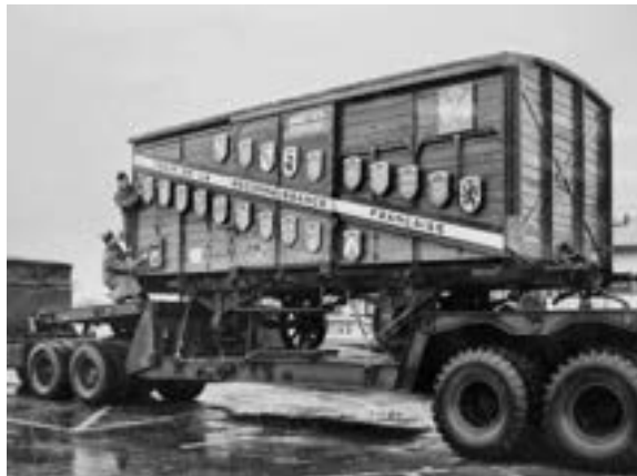
New Jersey's 40&8 Merci boxcar, arriving here in 1949.