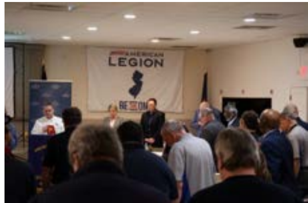
(Left) The morning session at Neptune Post 346. (Right) The afternoon session at Rahway Post 5.