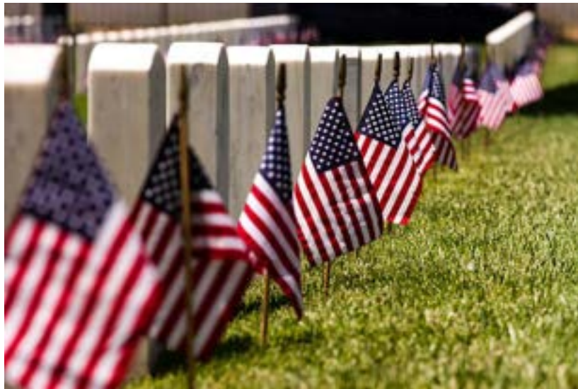
Be-The-One Seminar, 15-Mar-2025 at Neptune Post 346 and Rahway Post 5.