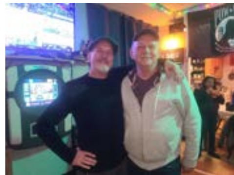
(Left) SAL Commander Hodum (left front) t meeting with Department of NJ DEC's, 12-Apr at Middlesex Post 306. (Center) Sweet treat time! Myers Family Crew's Girl Scout cookie delivery from Belleville 105 with staffers at Lyons VA Hospital. Also, they delivered cookies to East Orange VA Hospital, 16-Apr. (Right) Just a cheese pose from Nutley 70 SAL Vice Commander Infield and Post Commander Bennett.