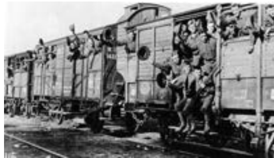
Left: Article from 1949. Center: British soldiers in a 40&8 during WW1. Right: American doughboys in 40&8.