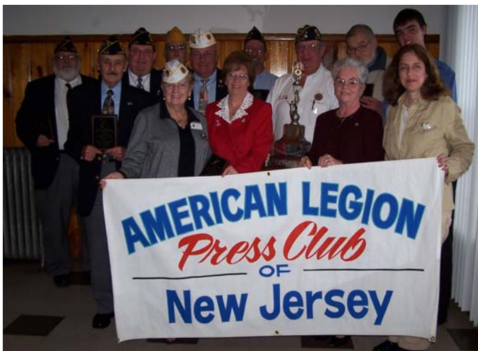
2005 Recipients of New Jersey's ALPC Awards