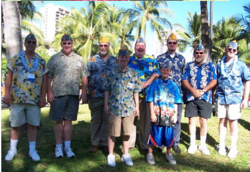
Sons Gather to March in Hawaii;